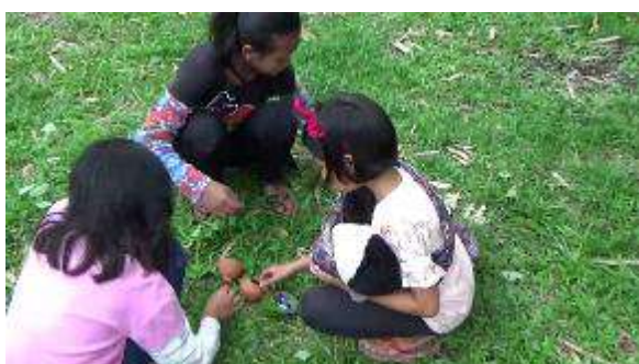
Figure 1. Children are playing dedek-dedekan in the garden

The character of affection is the significant characteristic of humanity. People having great affection has a high value of humanity. The value must be fostered since early childhood. In rural areas, especially villages, the ‘ dedekan ’ game is played in the wide open front yard of a house or in the spacious garden serving as children’s playground. The word ‘ dedek-dedekan ’ is an iconic term derived from the diminutive vocative address ‘ dik ’ or its variant ‘ dek .’ It comes from the word ‘ adik ’ which means ‘little brother or little sister. Through the instilment and development of children’s character of affection through traditional children’s game ‘ dedekan ’, there were no cases of babies being abandoned, killed, neglected, sold, and abused [31]. Thus, it can be confirmed again that the game ‘ dedek-dedekan ’ trains children to respect life [32].