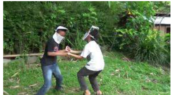
Figure 4. Children are playing topeng-topengan in the garden

The value of local wisdom contained in the ' bentik ' game is fighting spirit and agility. The fighting spirit is trained by accustoming children to levering the stick as hard as he could to reach the distance as far as possible. The value of agility is trained by their ability to catch the ejected stick dexterously. The local values were intended by our ancestors to get children used to work hard instead of complaining, focusing on difficulties, and feeling helpless when they grow up [34]. Moreover, the exercise on agility during childhood will make them agile, smart, dexterous, and quick-witted adults.