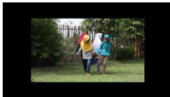
Figure 10. Children are playing dingklik oglak aglik in the garden

Training children's intelligence is not merely done through formal learning at school, but it can also be done through playing with peers outside of classroom. By testing their intelligence using a trivia quiz game, the children are trained to be smart, capable, resilient, and knowledgeable individuals when they grow up [40]; [41]. In the traditional children's game 'mekrok', the intelligence test is done through a fun and exciting trivia quiz game.