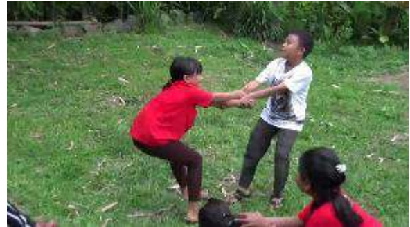
Figure 8. Children are playing a role as 'policemen' and 'thieves'

The local wisdom value of the ' polisi-polisian ' game deals with discipline and obedience in life. In the society, social harmony can be maintained when everyone realizes the essence of discipline and obedience to norms. Criminal cases occur because community members disobey norms [39]. Television reports widespread violation of discipline and obedience to the law and this indicates that the values of discipline and obedience are not deeply-ingrained in the minds of the people since they were young. Nowadays, it is rare to see children playing roles, such as in the ' polisi-polisian ' game, which in turn can aggravate the future children's sense of discipline and obedience.