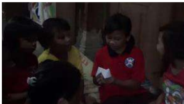
Figure 9. Children are playing mekrok using papers