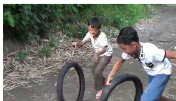
Figure 2. Children are playing rerodaan in the village street

The value of fighting spirit and agility is an important character to be instilled and developed in the minds of the children since early age. The success of the value implant can greatly impact on the children’s success in their adult life. The game ‘ rerodaan ’ is played by village children because the game is cheap and the material is available anywhere. In addition, there are still vacant lots where children can play the game freely without having to endanger themselves and other people. It is revealed that some people who are successful today used to play the traditional game ‘ rerodaan ’ when they were children because this game taught them to have relentless fighting spirit and agility which have shaped their character to be resilient [33].