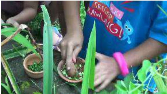
Figure 7. Children are playing a role as cooking housewives

The woman's gender role as housewives is to prepare meals for the family and the male gender role is to look for food and all other ingredients. This destiny is implanted among children since early age. Some families still maintain the roles. However, some families cannot maintain the gender-based labor division due to several conditions and reasons. Even though the development of times allows the destiny-based gender roles to be modified, in reality some gender roles are very essential and irreplaceable (Lieberman, 2009).