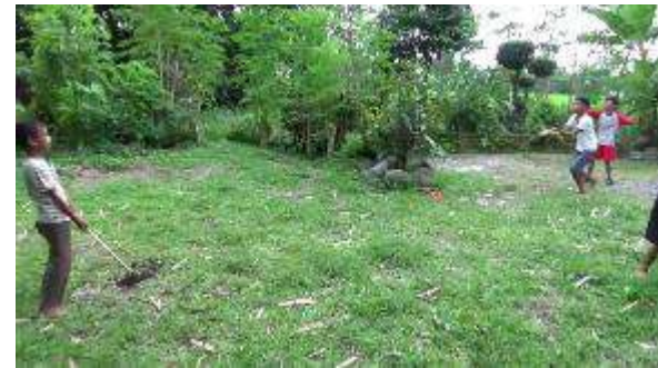
Figure 3. Children are trying to lever the stick in the bentik game