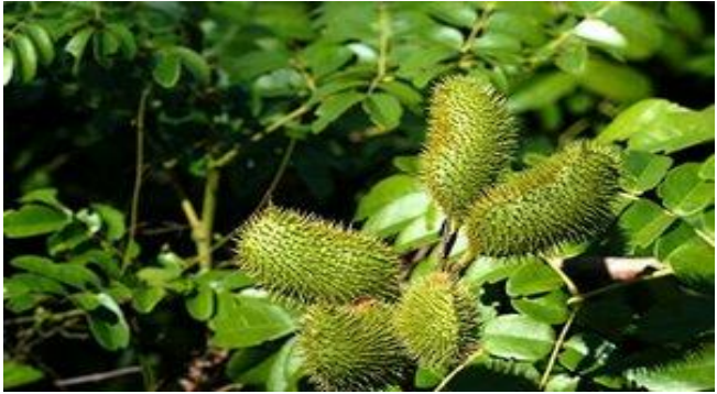
(https://www.bukalapak.com/p/kesehatan-2359/obat-suplem en/obat-obatan/w6sfcc-jual-buah-kalaloyang-atau-buah-gor ek)

E. Buah Kalaloyang atau Gorek or Guilandina bonduc, commonly known as nicker bean