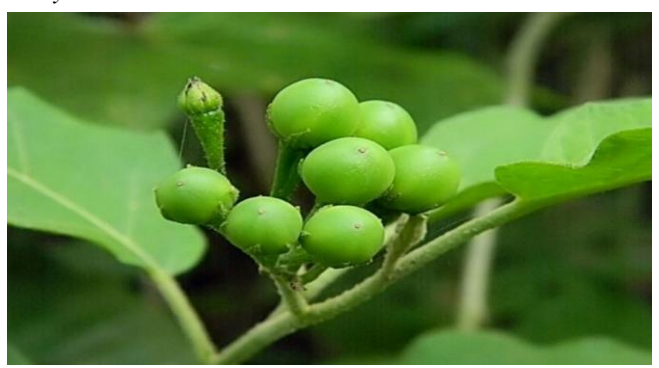
(<a href="https://www.inibaru.id/indo-hayati/takokak-kecil-dan-pahi">https://www.inibaru.id/indo-hayati/takokak-kecil-dan-pahi</a> t-tapi)

M. Buah Takokak or Solanum torvum, known as turkey berry