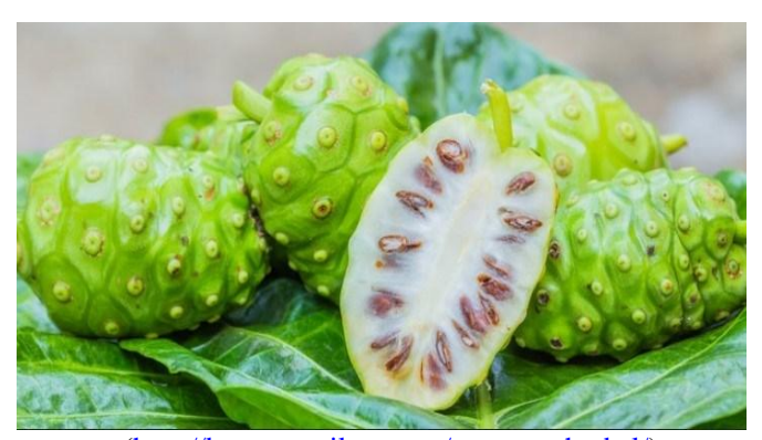
(<a href="http://kampoengilmu.com/tanaman-herbal/">http://kampoengilmu.com/tanaman-herbal/</a>) Figure 1. Buah Mengkudu or Morinda citrifolia

A. Buah Mengkudu or Morinda citrifolia, known as Indian mulberry, noni, and cheese fruit