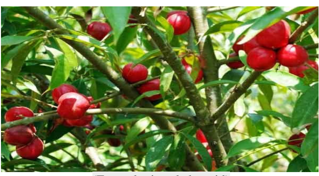
(Foto: okutimurkab.go.id) (http://www.satuharapan.com/read-detail/read/mahkota-de wa-buah-simalakama-si-raja-obat)

F. Buah Mahkota Dewa or Phaleria macrocarpa, known as God's crown