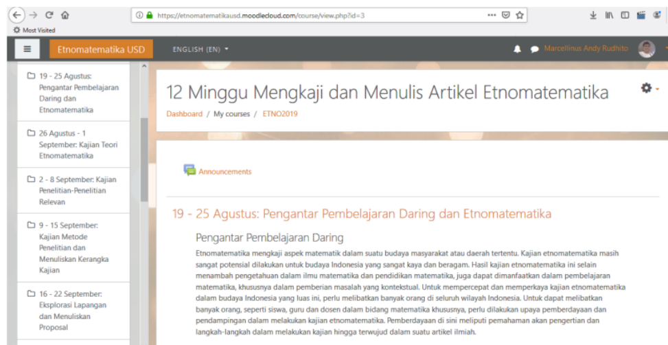
Figure 1. Display the beginning of the developed online class

From the above design, then online classes are arranged in Learning Management Systems (LMS) Moodle. The online class is entitled “12 Minggu Mengkaji dan Menulis Artikel Etnomatematika” (12 Weeks Studying and Writing Ethnomathematics Articles). The web address is https://etnomatematikausd.moodlecloud.com/ . While the online class web display in the introduction is as follows.