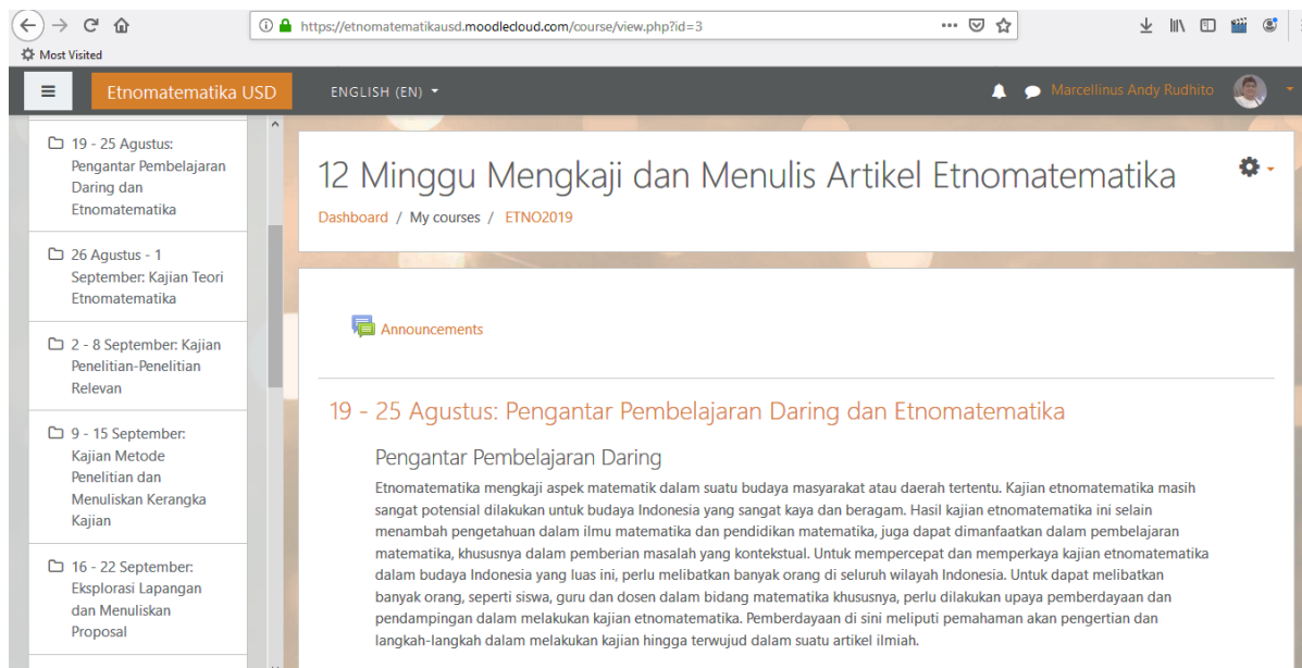
Figure 1. Display the beginning of the developed online class

From the above design, then online classes are arranged in Learning Management Systems (LMS) Moodle. The online class is entitled “12 Minggu Mengkaji dan Menulis Artikel Etnomatematika” (12 Weeks Studying and Writing Ethnomathematics Articles). The web address is https://etnomatematikausd.moodlecloud.com/ . While the online class web display in the introduction is as follows.