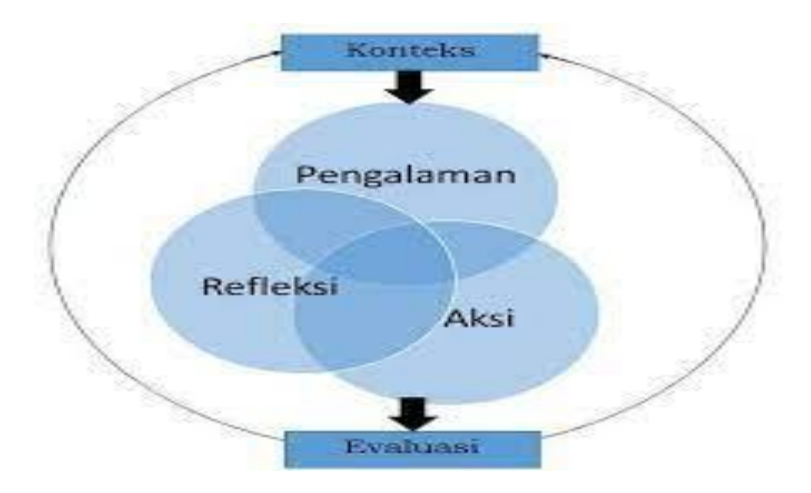
Figure 1. Ignatian Reflective Learning Cycle

Researchers used an Ignatian-based reflective learning cycle with five learning cycles, namely (1) context, (2) experience, (3) reflection, (4) action, (5) evaluation (Setyaningsih et al., 2020).