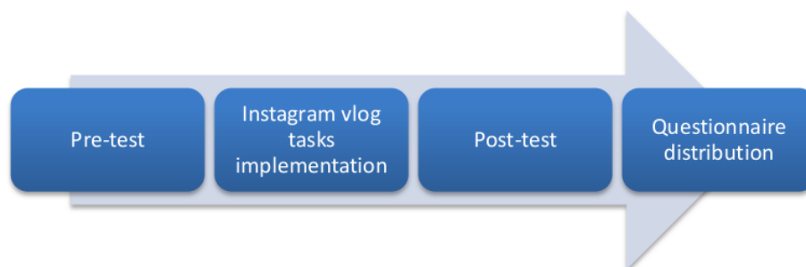
Figure 1. Data Gathering Technique Chart