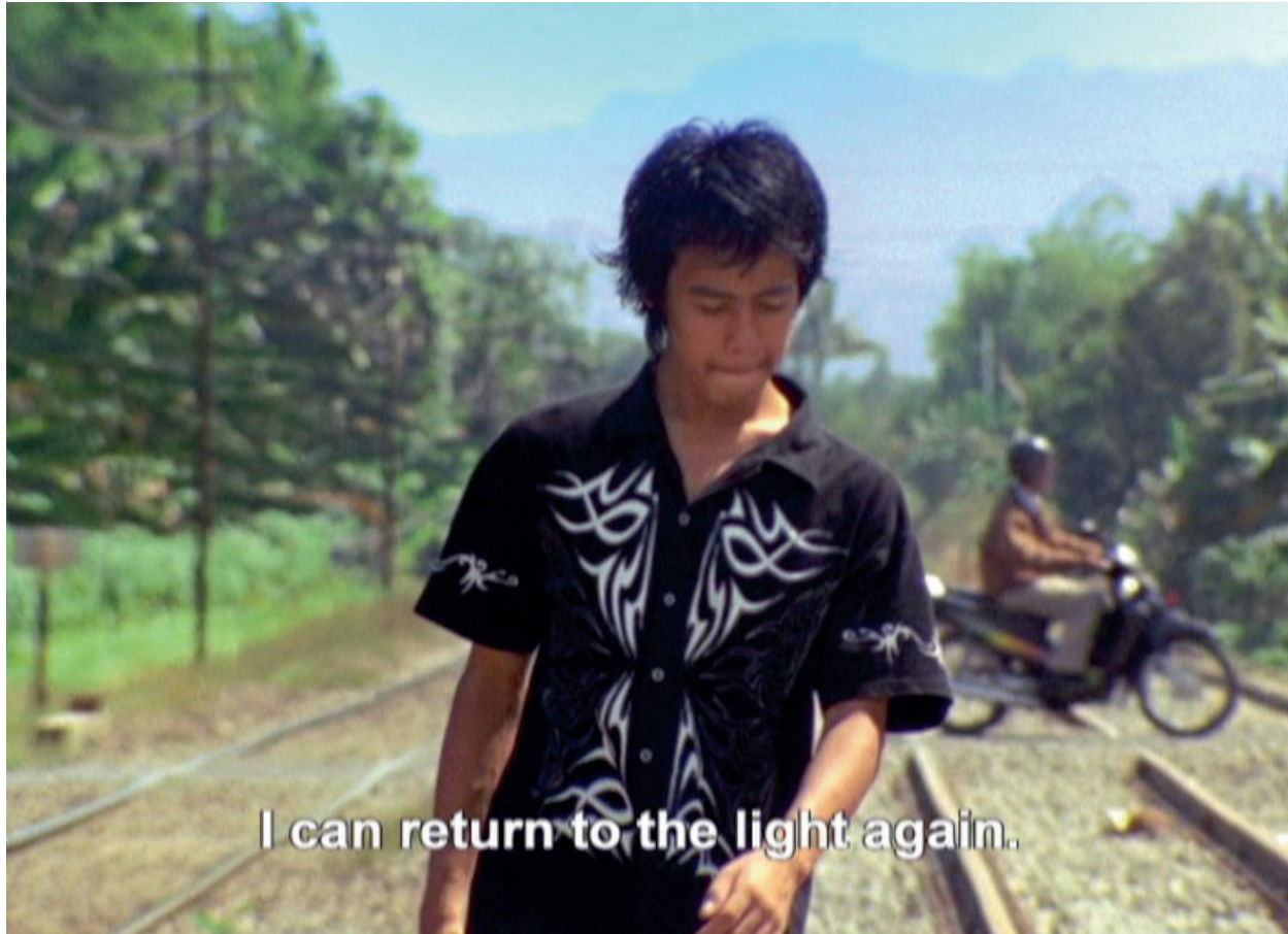
Fig. 2.8 Budi's hope for himself