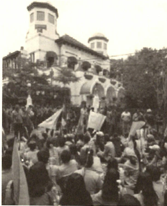
Protests against Buddha Bar Indonesia on March, 2009

Buddha Bar Jakarta, a local branch of Buddha Bar International, has been embroiled in religious controversy from the day it opened. The bar was accused of using Buddhist sacred symbols inappropriately since it sold alcoholic drinks, which Buddhist teaching forbids. There had been other commercial products in Indonesia that made use of religious symbols one way or another, and some of them had also caused serious controversy. The tumult surrounding the use of Buddha’s name and image in the Buddha Bar was the newest in a long list of cases in Indonesia in which religious sensibilities were stirred up.