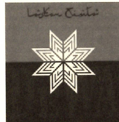
The cover of the Music Album "Soldiers of Love" depicting calligraphy resembling the word " Lafdhul Jalalah " ( Allah or God ) Source: http://www.xtramusik.com/2012/05/dewa-19-laskar-cinta-album-2004.html .

A third case occurred in April 2005, when another music album, entitled " Laskar Cinta " ("Soldiers of Love") by a group called Dewa, featured an illustration that used calligraphy resembling the word "Allah" in Arabic characters. The protest was initiated by a radical Moslem organization, Front Pembela Islam (Defending Islam Frontage), and supported by several other Islamic organizations. The protesters demanded Dewa to publicly apologize for the mistake they committed, withdraw all the albums already distributed in the market, and replace the album illustrations. The case was resolved quickly when the group and the recording company fulfilled all of the protesters' demands. 12