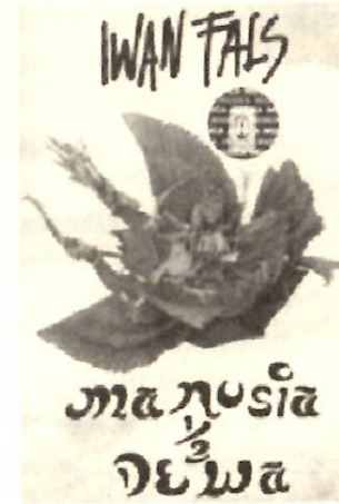
The Cover of the Music Album "Half- Man and Half-God" which depicts the Wishnu God

Another case occurred in 2004 when a picture of Wishnu was used to illustrate a song title in an album by Iwan Fals. He composed a song entitled " Manusia Setengah Dewa " ("Half-Man and Half-God") which was then provided an illustration using a figure resembling Wishnu. A Hindu community protested against this, which they thought was a profane use of the Hindu divinity. The controversy, however, ended relatively quickly since several other Hindu organizations and some influential Hindu figures supported Iwan Fals. They said that the use of the symbol was acceptable. Still, the recording company in deference agreed to stop the production of the album cover, but would not withdraw the CDs already distributed in the market. 11