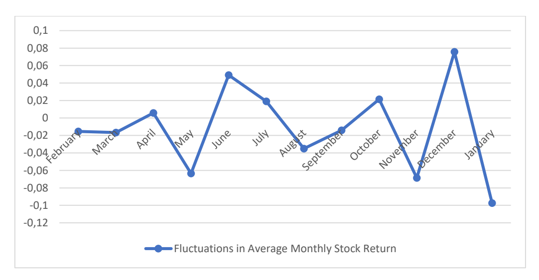
Figure 2. Fluctuations in Average Monthly Stock Return

The difference of the average return of monthly stocks indicates the possibility of a month of the year effect. In January the average monthly stock return was the most negative compared to those of the average stock return of other months indicating the possibility of January effect. The January effect occurs when the average stock return in January is the most positive compared to the average return of other monthly stocks.