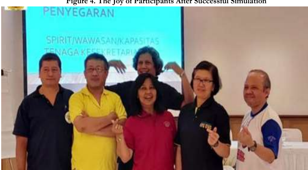
Figure 4. The Joy of Participants After Successful Simulation

The final activity of the program is evaluation and reflection. 19 participants requested to give opinion based on 8 statement. They are gives 5 choices answer in each statement, ranging from 1 (strongly disagree), 2 (disagree), 3 (neutral), 4 (agree), and 5 (strongly agree). The average scores of each statements are 3.40 – 4.19, and classified as "good". Table 2 shows the statements and the classification (category) of the participant statements.