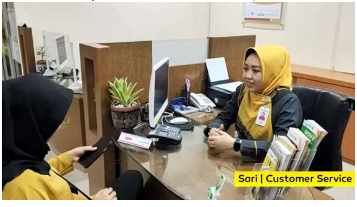
Figure 3. Video How To Handle Customer Complaint