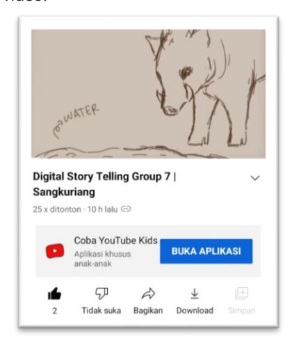
Figure 3. The result of design implementation.

should make sure that all the students have the tools needed. They should have access to a computer or laptop, at least with Microsoft PowerPoint. They should also have access to the voice recorder tool on their mobile phone. Students who live near campus may use the facility in the language laboratory; complete equipment is provided there. This project is done in a group of 3-4 students so that they can back up each other. The following figure is a digital storytelling video that was uploaded by group 7. Before making it public, the video is set in an unlisted mode to be reviewed by classmates and the instructor. Only the people who have the link to Youtube can watch the video.