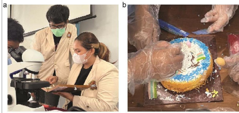
Fig 1. Classroom Activities: a. Observing Plants Cell under the Microscope on Day-1, b. Constructing Edible Cell Model on Day-2

This community service was a two-day program consisting general information, concept, and plant observation at day-1 (Figure 1a); followed by hands-on activity to construct the cell model from edible materials (Figure 1b). In the first week, we distribute the hand printout materials about cells in definition, types, and the organelles, including explaining the role and function of each organelle. This activity was followed by simple experimental activity to observe the plant cells from Hibiscus sabdarifa (Rosella petal tissue), Curcuma xanthorrhiza (rhizome tissue) and Andrographis paniculata (leaf) under the light microscope. Then, the students drew the plant cells on those tissue on the paper. This objective of the first day is to understand the cells concept in our body.