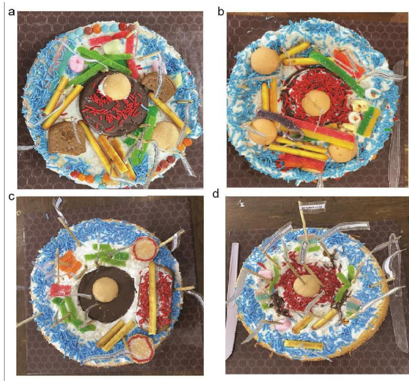
Figure 2. The rewarded team of the most biomimicking cells. a. The teams of Grade VI b. The teams of Grade V

Furthermore, the second day of this program was the continuation of what have been done in the first day. In particular, every class was divided into 4 groups, then each of them got the set of edible materials consists of cake, cookies, messes, gummies and candies to engineer their own animal cell models detailed with the organelle's label. This models were created based on some previous references [10-12]. Moreover, we selected two among those group of each class as the closest model of the real cells. The selected animal cells models were the most biomimicking cells decorated with the correct label of the organelles from Grade V (Figure 2a, 2b) and Grade VI (Figure 2c, 2d).