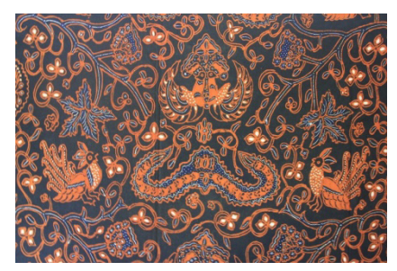
Figure 1 . Figure and title not more than 5cm in Height.