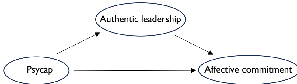
Figure 1. Conceptual Framework