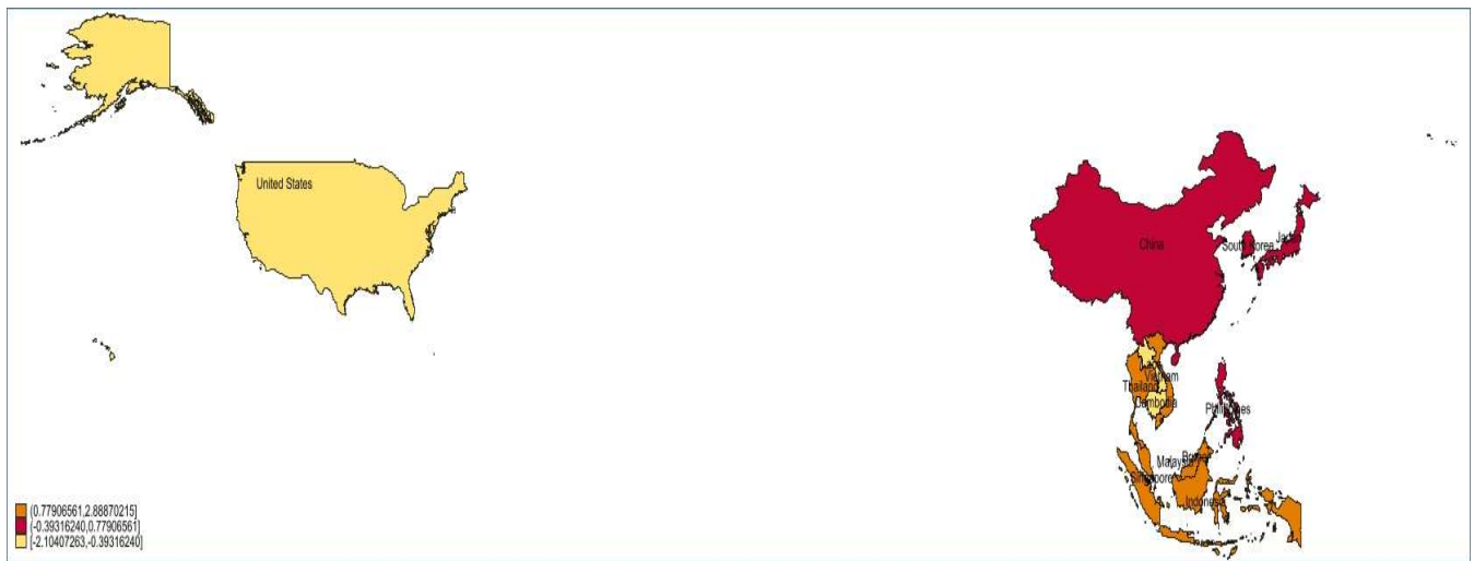
Figure 1. Interest rate in the United States and ASEAN+3 in 2020.

authority policy on the output gap of countries in the region (Georgiadis 2016; Ntshangase et al. 2023; Miranda-Agrippino and Rey 2020).