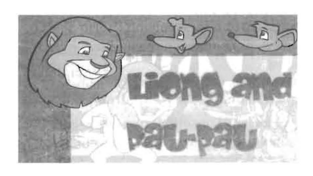
Picture 2. Third book being read "Liong and Pau Pau" and one page in Perpustakaanku

text and/or story. This happened when she wrote her response journal to respond to the fifth reading. In the fifth reading the writer read an Indonesian story Perpustakaanku. In one of the pictures, there was a picture of a lion in front of the library. After looking at that picture, she directly took her book and wrote "Liong" several times in scribble writing form. Scribble writing form is "wavy lines that do not look like letters, but look like writing" (Peregoy & Owen, 2005, p. 169). It is clear that she makes connection of the story to the previous story "Liong and Pau Pau" in the third read aloud activity. Instead of writing "lion", she wrote "Liong" because in the story of "Liong and Pau Pau" the lion's name was Liong.