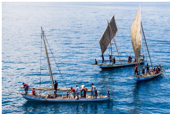
Figure 3. Pledang Lamalera in the Sawu Ocean

The making of the pledang begins with the ritual called pau laba ketilo , an event at the traditional house, atamola . All tribes are invited to participate in worship, prayer, and rituals to honor ancestors and offer sacrifices to the specific tools that will be used so that the pledang -making process can proceed smoothly and successfully.