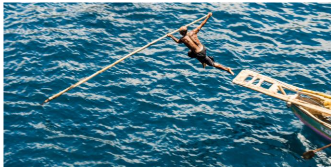
Figure 2. Lamafa Harpooning a Whale

The hunting is carried out using boats made of wood called "peledang." The person responsible for harpooning whales is called lamafa. A lamafa stands at the end of the boat to harpoon the whale. The lamafa will jump and thrust the harpoon called "tempuling" into the whale. A lamafa, the harpooner leading a group of sailors or rowers, is ready to give the command to launch the peledang, a specially made boat for whale hunting.