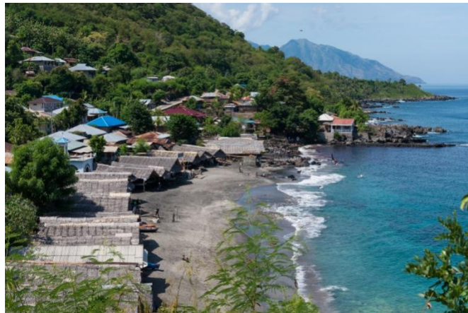
Figure 4. Naje: Boat House

Damaged and weathered boats find their place in naje. These boats are never discarded or sold as old or scrap items. The boats are highly sacred. The ancestral messages passed down through generations are strictly adhered to by the local community. Boats, especially peledang ( tena lamafaij ) used specifically for whale hunting ( koteklema ), cannot be sold under any circumstances. Lamalera boats cannot be brought in from outside the region or taken out of the area.