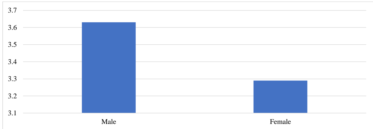
Figure 2. Students' FLVCA level

Based on the data, both male and female students show low level of FLVCA. One of the contributors is students were already familiar with the technology needed in the classroom. However, half of the students were anxious about getting disconnected from their internet connection. In the interview, 25% of the students said that when they got disconnected, it made them panic. However, it did not give them intense anxious feelings. 24% of the students did not feel ignored by their lecturer during the online classroom setting. It indicated that the lecturer managed to build a supportive atmosphere for learning. The researchers confirmed that the lecturer paid detailed attention to students' gestures from the classroom observation log. The lecturer often gave comments related to students' gestures not for the sake of formality but also to build an intimate connection with them.