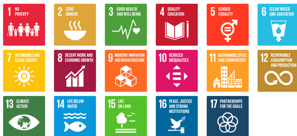
Figure 1. Sustainable Development Goals (SDGs).