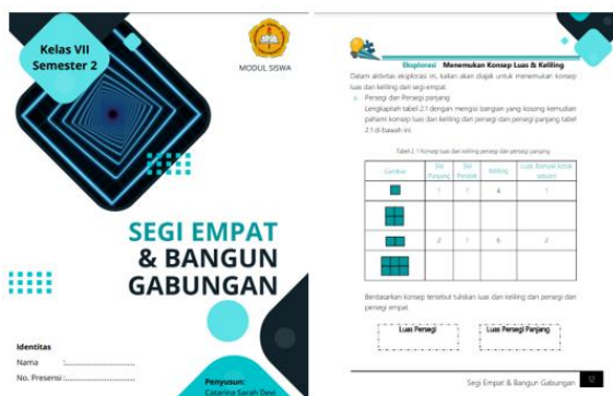
Figure 2. Display of the learning module

module that researchers have created as shown in the picture.