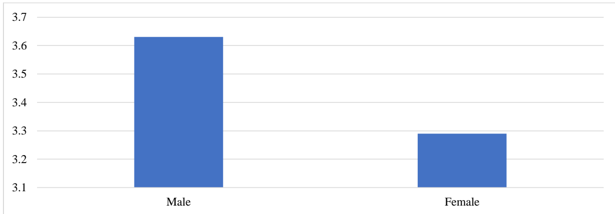
Figure 2. Students' FLVCA level

Based on the data, both male and female students show low level of FLVCA. One of the contributors is students were already familiar with the technology needed in the classroom. However, half of the students were anxious about getting disconnected from their internet connection. In the interview, 25% of the students said that when they got disconnected, it made them panic. However, it did not give them intense anxious feelings. 24% of the students did not feel ignored by their lecturer during the online classroom setting. It indicated that the lecturer managed to build a supportive atmosphere for learning. The researchers confirmed that the lecturer paid detailed attention to students' gestures from the classroom observation log. The lecturer often gave comments related to students' gestures not for the sake of formality but also to build an intimate connection with them.