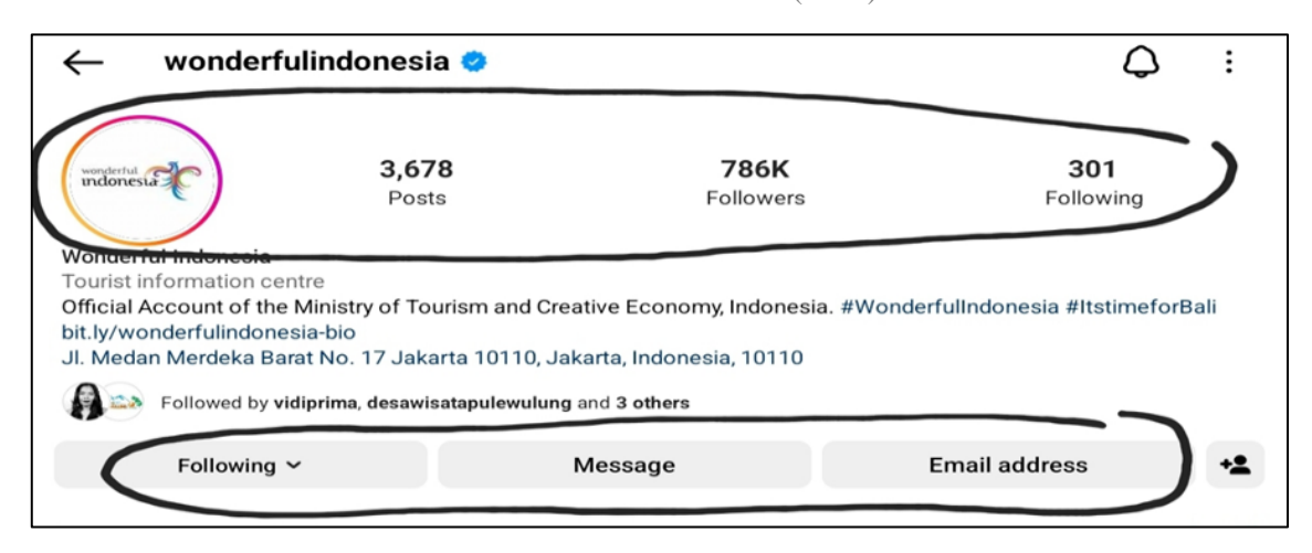
Figure 6. The Official Social Media Customer Views and Comments