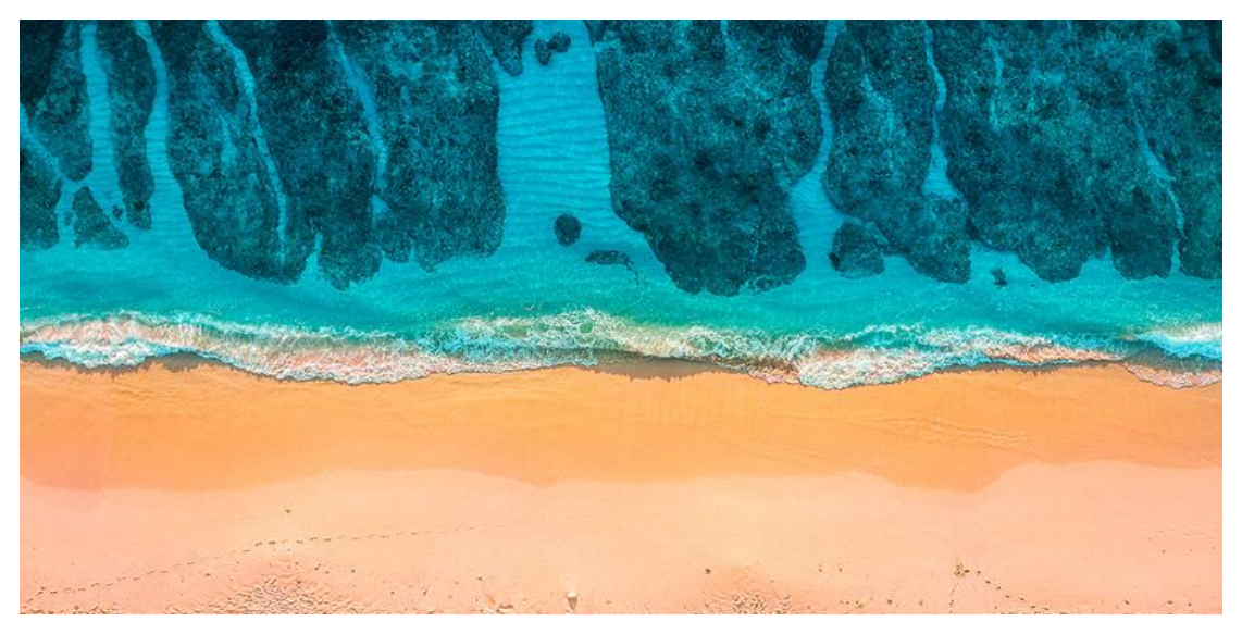
Figure 3. Likupang Beach in Sulawesi Island

recommend you Likupang: a new paradise in the north of Sulawesi Island. Clear colour, message is clear and convincing someone to visit."