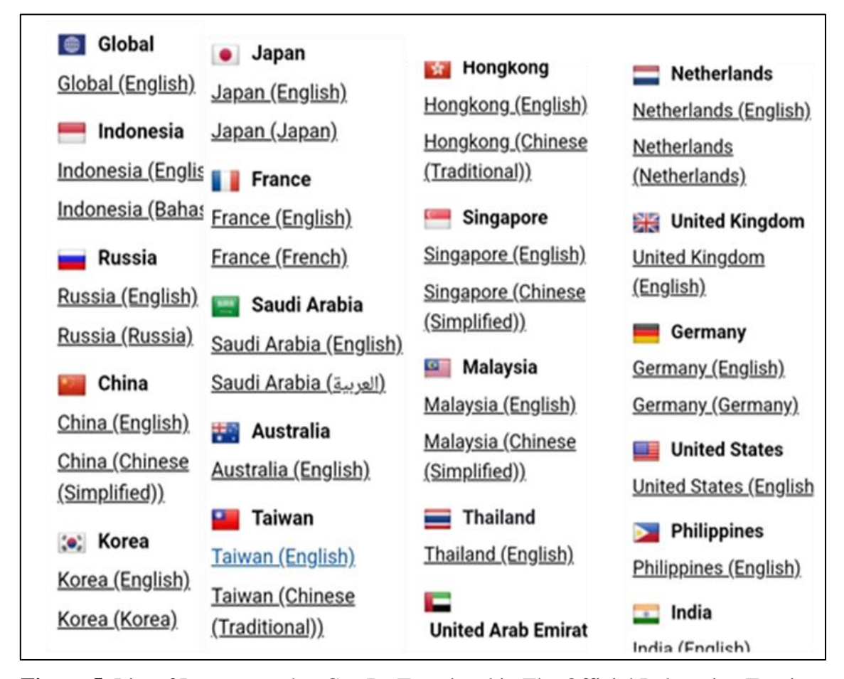
Figure 5. List of Languages that Can Be Translated in The Official Indonesian Tourism Website

Indonesia, Korea, Russia, Indian, Japanese, and United Arab Emirates), Australia (Australian languages), American continents (Both North and South) (English language), Europe (French, Netherlands, and also English), but the website did not show the language spoken in most of the African continent countries (Swahili language), and excluding Antarctica which is the only continent with no permanent human habitation. So, this causes some of the viewers, especially from Africa continent, not to see and feel the beauty of the websites because they were not directly involved with websites. Normally viewers interpret the goodness of the website only when they understand clearly what has been displayed on the explanation, colour as well as narrations of the attractions themselves.