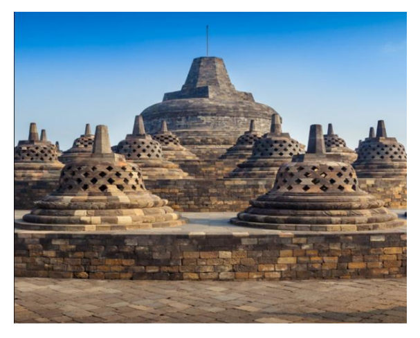
Figure 4. Borobudur Temple

\frac{https://www.youtube.com/watch?v=iDI-uCJTkf8}{uCJTkf8}.