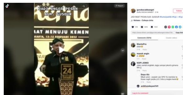
Figure 3. Political humor by TikTok user @gurukocakbanget.

Secondly, the rapid dissemination of satirical content through TikTok's algorithmic architecture can amplify marginalized voices, fostering a sense of collective agency and potentially influencing public opinion. Moreover, the performative nature of TikTok satire, often incorporating visual and auditory elements, can contribute to the formation of a shared cultural lexicon, facilitating the articulation of political grievances in a manner that resonates with contemporary digital natives.